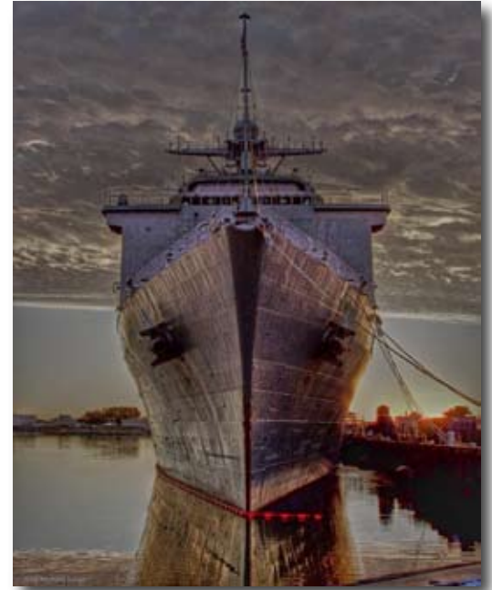
February Digital Alternative 1 st Place Winner for “The Ship at Sunset”

EDUCATION MEETING: Next meeting March 17 th at 6:30 PM in the Church Classroom.