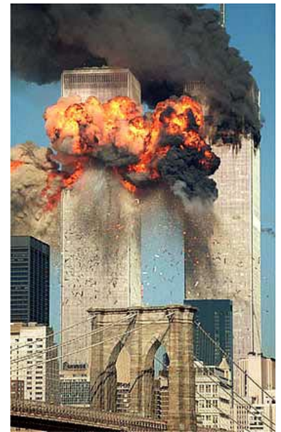
2002 Pulitzer Prize for Breaking News Photography World Trade Center Attack New York Times Staff