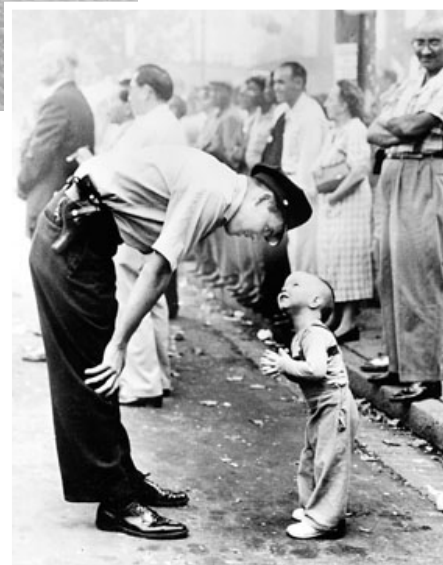
1958 Pulitzer Prize for Photography "Faith and Confidence": A policeman speaks to a young boy at a parade in Washington, D.C.