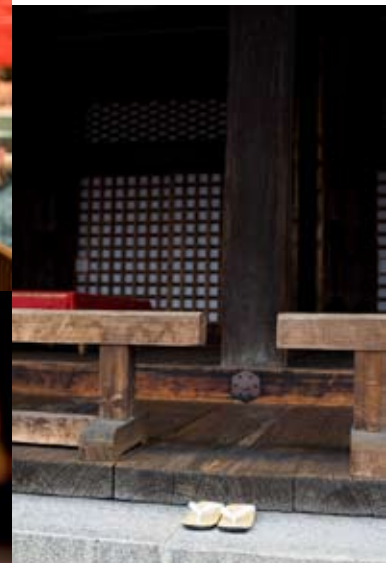
Three of Mike's favorite photographs.